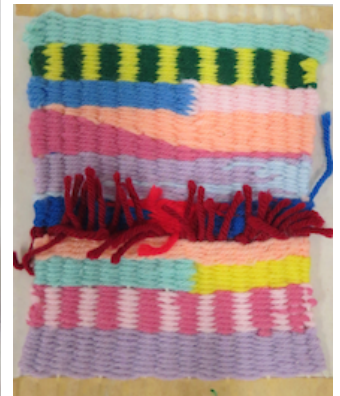
Weaving samplers using yarn