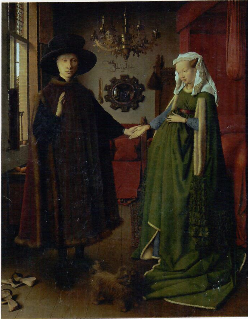
Eyck, Jan van (c.1390-1441) The Arnolfini Wedding. Wedding picture of Giovanni Arnolfini and Giovanna Cenami, Bruges, 1434. National Gallery, London.

Many changes took place in Europe and the world between 1400 and 1600. Explorer Christopher Columbus discovered America, and Magellan sailed around the globe. Trade expanded to places it had never been before.