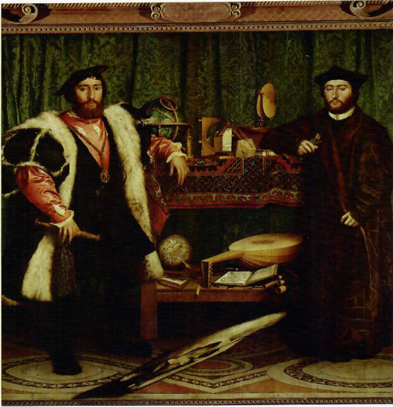
Holbein, Hans the Younger (1497-1543) The French Ambassadors of King Henry II at the court of the English King Henry VIII. Oil on canvas (1533). National Gallery, London.

Raphael (rah-fa-yell) Sanzio was taught the rudiments of painting by his father, a mediocre painter. By age 17 he was an independent master. He was called to Rome at age 26 to decorate the Vatican's rooms. Raphael completed his frescoes the same year Michelangelo finished the Sistine Chapel ceiling. Rich, handsome and successful, he went from triumph to triumph as star of the Papal court. Raphael's art expressed all the qualities of the High Renaissance. He borrowed techniques from both Leonardo and Michelangelo. He died at the early age of 37.