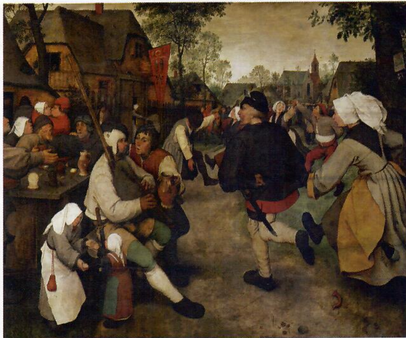
Brueghel, Pieter the Elder (c.1525-1569) Peasants' Dance. 1568. Oil on oakwood. Location: Kunsthistorisches Museum, Vienna, Austria.

Albrecht Dürer (Dur-er) was called the "Leonardo of the North" for his diverse interests. He was fascinated with nature and made botanical studies of plants. He published writings about the discoveries in Italy to enlighten his northern colleagues. His work in graphics assured Dürer's reputation as a great artist. Woodcut prints were primitive studies in only black and white contrast until he achieved a scale of light to dark by adapting cross hatching from engraving to woodcut printing. He used dense lines to render differences in texture and tone. Dürer was the first to use printmaking as a major medium of art.