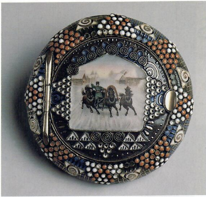
Firm of Fabergé, Carl (1846-1920) Round Box , silver gilt and enamel, Diameter: 5.8 cm. Date: 1906-1916, The India Early Minshall Collection. The Cleveland Museum of Art, Cleveland, Ohio.

any given background pattern onto a sheet of metal.