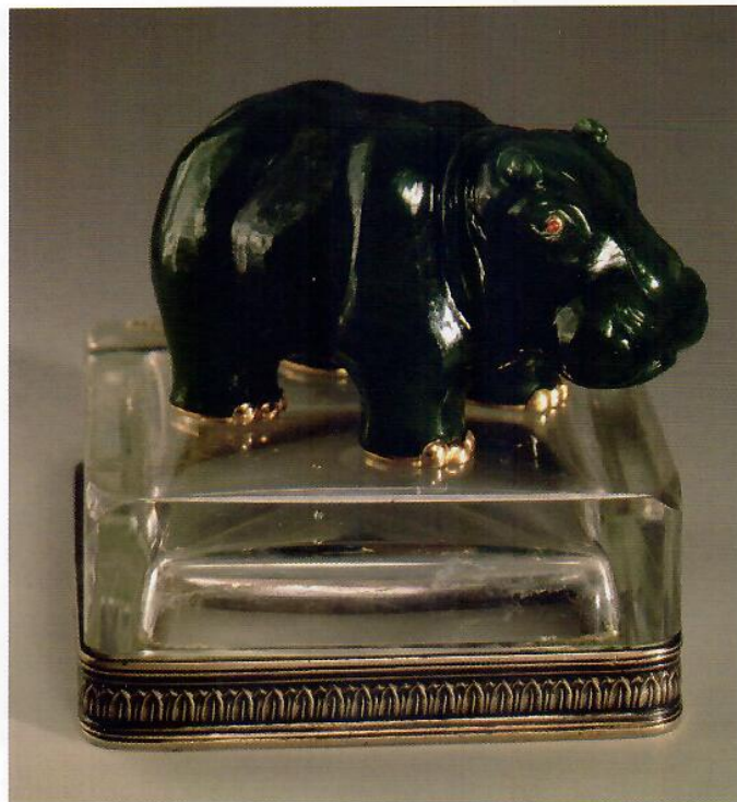
Fabergé, Carl (1846-1920) Hippopotamus, 1908-17. Carved nephrite. Location not indicated.