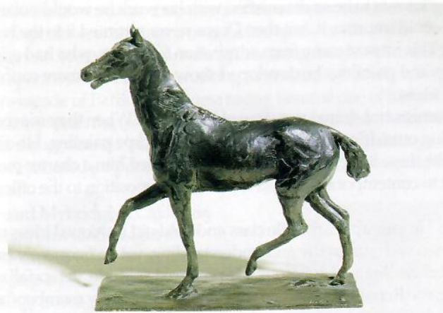
Degas, Edgar (1834-1917). Horse high-stepping, 1865-1881. Bronze statuette. Musee d'Orsay, Paris, France.

By 1907 Degas was totally blind, but his work had become well known and was selling for large amounts of money. He died in 1917, full of self doubt and with a sense of failure about his work. All the figures found in his studio, including Little Dancer Aged Fourteen , had been modeled in wax. None were cast in bronze until after his death. He left an invaluable collection of drawings, prints, pastels and oil paintings.