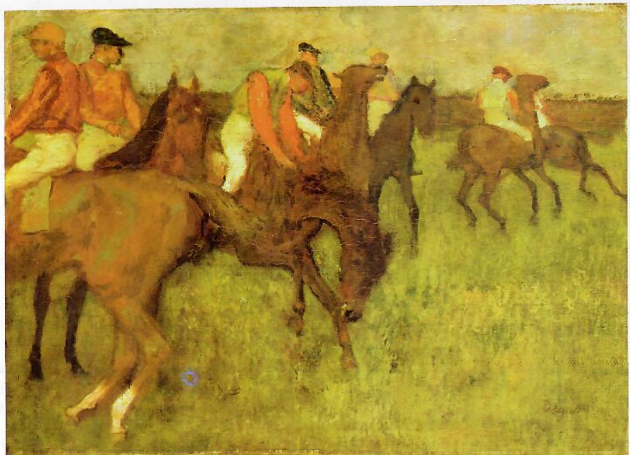
Degas, Edgar. (1834-1917). Jockeys, 1886-90. Oil on paper, 26 x 36. Private Collection.

The Paris Salon Exhibition was the big annual art show in Paris. It was named for the room, or salon in the Louvre Museum where it was originally held.