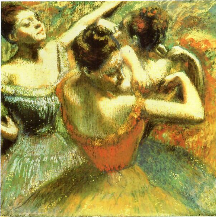
Degas, Edgar. (1834 -1917). The Dancers , about 1899, pastel on paper, 24 1/2 x 25 1/2 in. (62.2x64.8cm), Toledo Museum of Art, Purchased with funds from the Libbey Endowment, Gift of Edward Drummond Libbey.

attempt to sell it. He once convinced a buyer to give back a painting so he could improve it, but then Degas never returned it to the buyer.