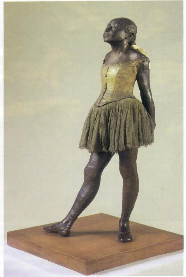
Degas, Edgar. (1834-1917). Little Dancer Aged Fourteen, Bronze sculpture, 1880-1881. Tate Gallery, London, Great Britain.

©2003 ARTaFacts™. All rights reserved. Material may not be reproduced in whole or in part in any form or format without permission from the publisher. For more info: go to www.artafactsmagazine.com or call 419 885-8830.